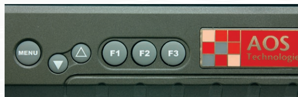
Dedicated control buttons for quick access to menu, exposure time, and user-specific camera settings.